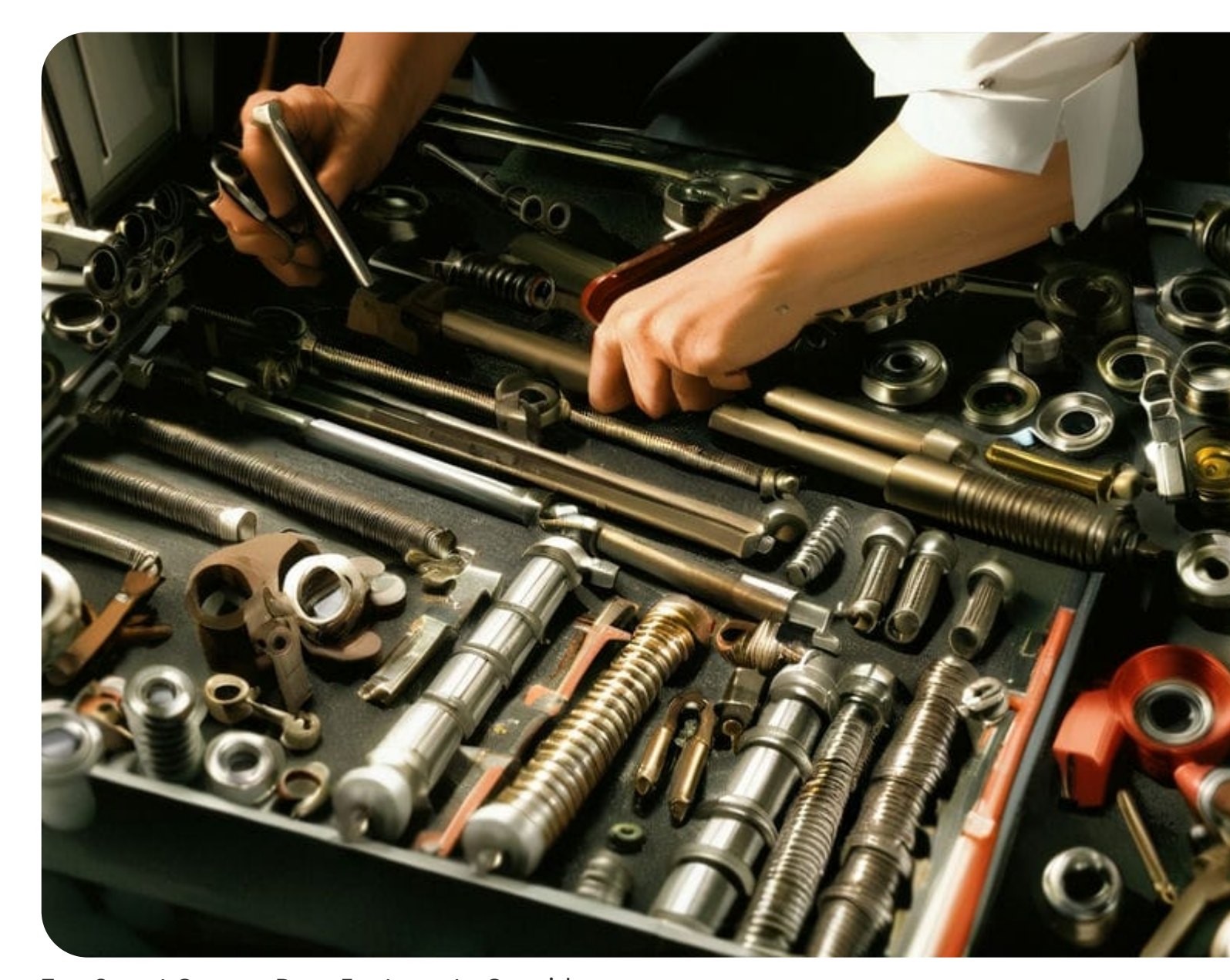
Top Smart Garage Door Features to Consider